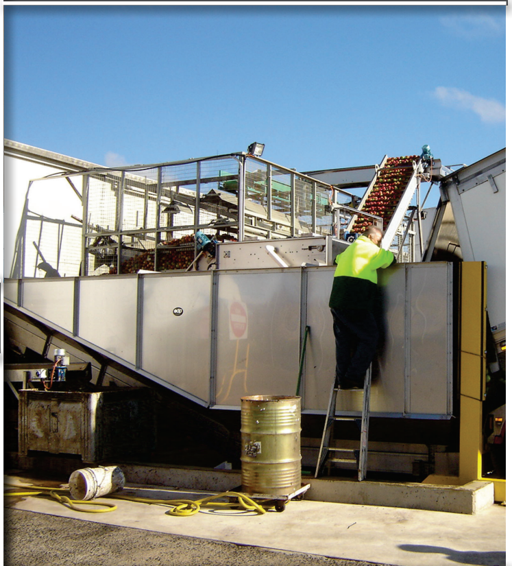
An edp custom built stainless steel bulk tip truck unload hopper.

In all case the edp hopper drive systems are a direct gearbox mounted drive with remote electronic variable speed control.