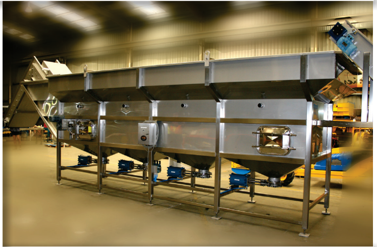
7 Tonne Stainless Steel wet hopper with webb chain moving floor and exit elevator, 4 individually programable flushing valves.