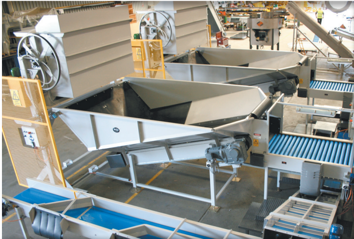
A pair side by side, edp two tonne moving floor hoppers, with edp electric bin tipplers and roller inspection tables.