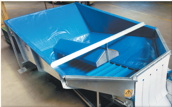
1 Tonne galvanised hopper with padding and turkeys roost over soft top cleated belt.

In all case the edp hopper drive systems are a direct gearbox mounted drive with remote electronic variable speed control.